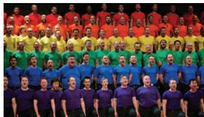
London Gay Men's Chorus