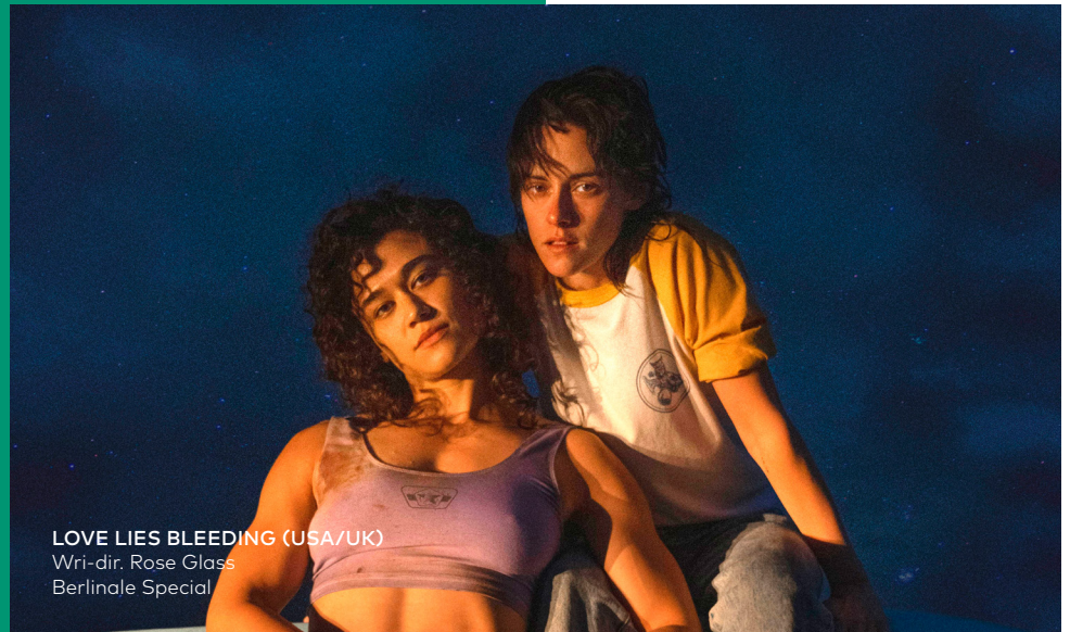
LOVE LIES BLEEDING (USA/UK) Wri-dir. Rose Glass Berlinale Special